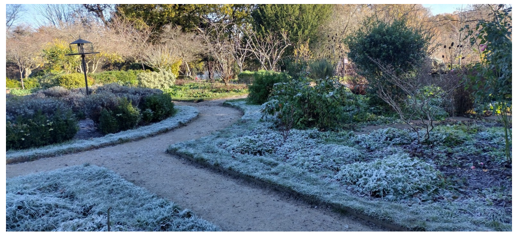
(photograph of the Sensory garden after the frost arrived but before the snow)